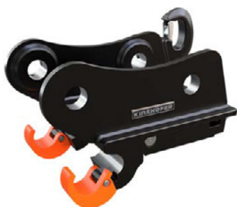
KHS21L+ here with hook

Package consists of: hydraulic quick coupler with drop stop claws, KHS10-25L installation set sensor, KHS-L-Sensor