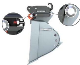
Unlocked for the coupling process. Indicator pin is extended.