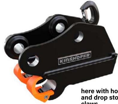
here with hook and drop stop claws

The hydraulic KHS+ quick couplers are characterized by a very high safety standard. The drop stop (extended quick coupler claw) prevents the attachment from falling down if the quick coupler lock is accidentally not locked properly. To further increase safety, the KHS+ quick coupler has also been equipped with the new safe lock indicator that reliably indicates proper locking. The KHS+ couplers fully comply with all applicable national and international standards and regulations, including Machinery Directive 2006/42/EG, DIN EN 474-1, ISO13031 and SUVA.