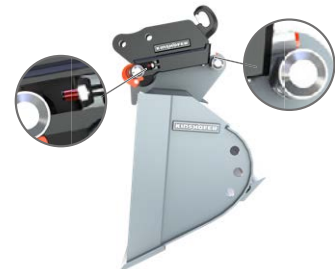
Not correctly locked. Locking pins are above the permitted range. Indicator pin is extended.