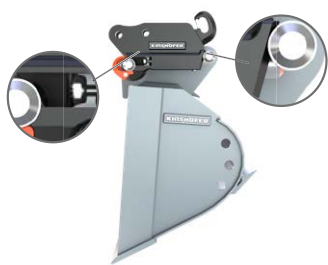
Safely locked. Indicator pin is driven in.

Package consists of: hydraulic quick coupler with drop stop claws and lock indicator