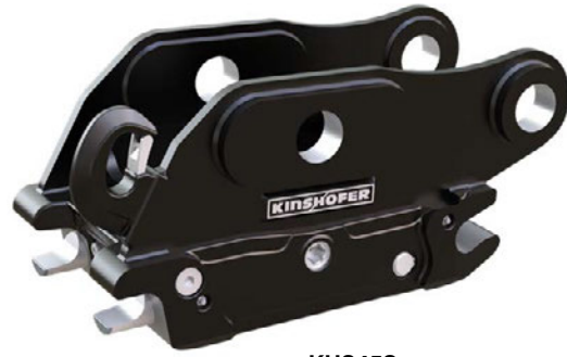
KHS45S here with hook