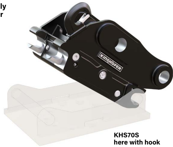
KHS70S here with hook